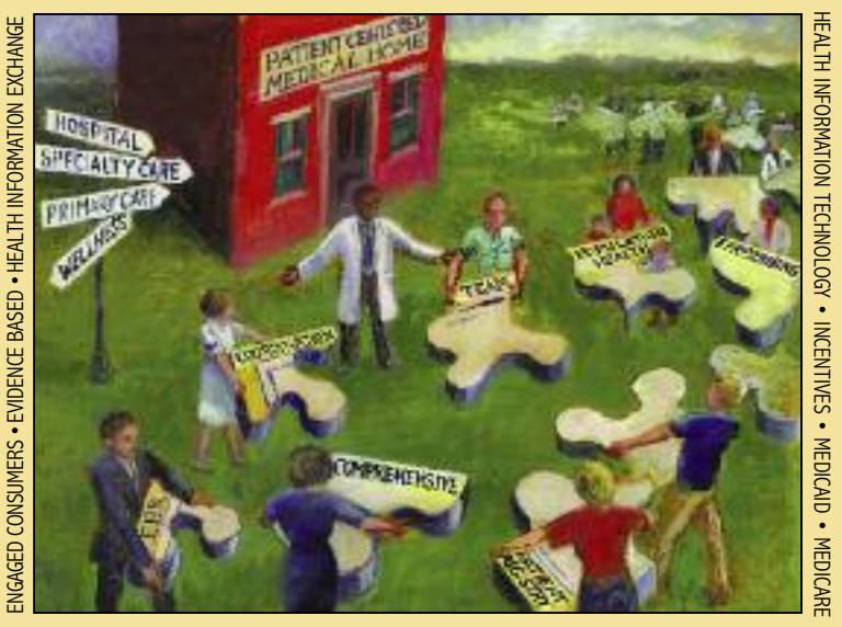
PATIENT ADVOCACY • PAYMENT REFORM • PHYSICIAN DIRECTED • PREVENTIVE CARE • WHOLE PERSON

CASE MANAGEMENT • CHRONIC CARE • COMPARATIVE EFFECTIVENESS • DISEASE MANAGEMENT