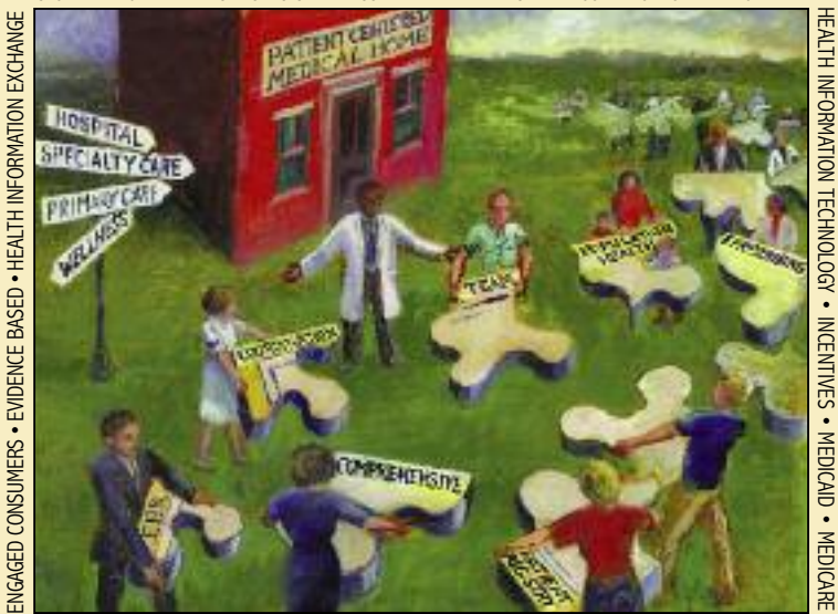
PATIENT ADVOCACY • PAYMENT REFORM • PHYSICIAN DIRECTED • PREVENTIVE CARE • WHOLE PERSON

CASE MANAGEMENT • CHRONIC CARE • COMPARATIVE EFFECTIVENESS • DISEASE MANAGEMENT