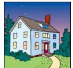
. . . or home

PROS: Live digital feed and 24/7 Internet access for the next six months; accessible in the office, at home or anywhere worldwide with Internet access; avoid travel expense and hassle; no time away from the office.