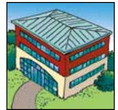
At your office . . .

The archived conference includes speaker videos and coordinated PowerPoint presentations.