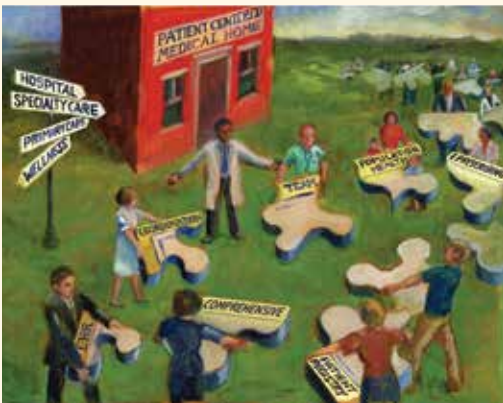
CASE MANAGEMENT • CHRONIC CARE • COMPARATIVE EFFECTIVENESS • DISEASE MANAGEMENT

Finally, the medical home training program associated with the Summit allows for a deeper dive into the subject matter and includes preconference readings, an online course, and an online exam as well as required participation in the preconference and the main Summit. Candidates earn a certificate of completion with a score of 70% or better on the final exam.