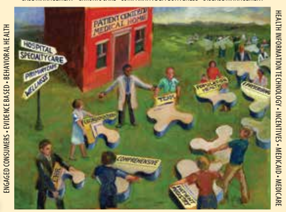
PATIENT ADVOCACY • PAYMENT REFORM • PHYSICIAN DIRECTED • PREVENTIVE CARE • WHOLE PERSON

CASE MANAGEMENT • CHRONIC CARE • COMPARATIVE FFFECTIVENESS • DISEASE MANAGEMENT